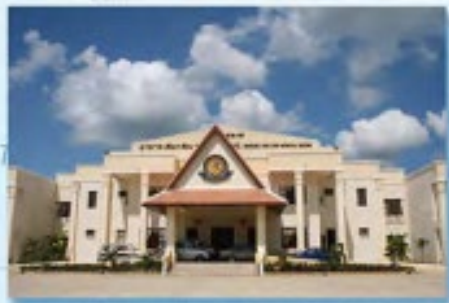
Kinbendharm ( Than Hsiang ) Foundation Thailand International Buddhist College 88, Mu 2, Thung Mo Subdistrict, Khuan Sato, Amphoe Sadao Songkhla 90240, THAILAND

Branch Campus at Korat (North-eastern Thailand): Korat Education Center