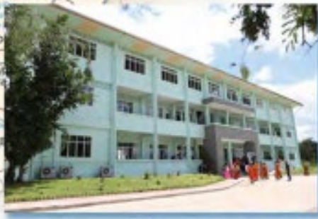
Kinbendharm ( Than Hsiang ) Foundation Thailand International Buddhist College Nakhon Ratchasima, 442/1, Mu 1 Thuanbi Muang Pak, Amphoe Pak Thong Chai Nakhon Ratchasima 30150, THAILAND